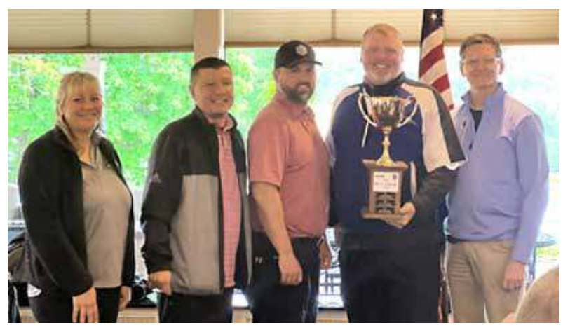
Winner of The Bell Tower Cup – Rocky Gap Resort