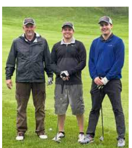
East Coast Auto Appraisers