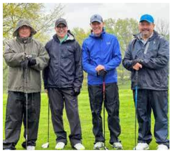
The EADS Group