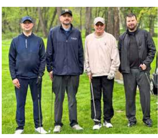
UPMC Western Maryland