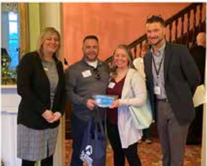
WOMAN'S CIVIC CLUB