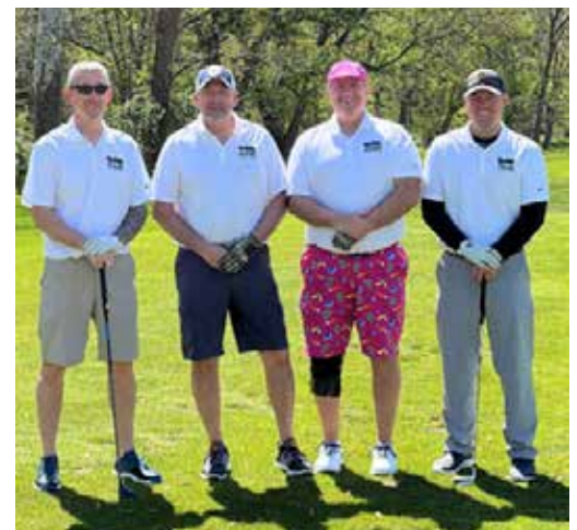
Allegany County HRDC