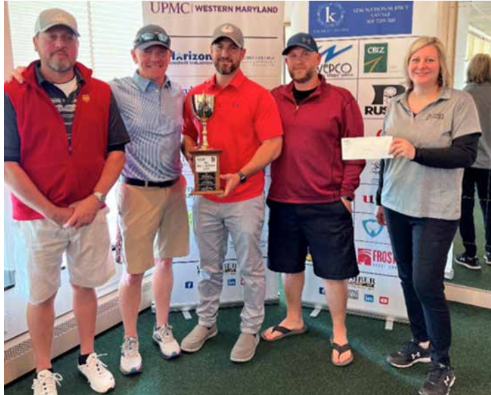
Winner of The Bell Tower Cup — ServiceMaster of Allegany County