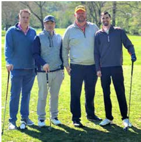
M & T Bank