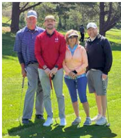
First United Bank and Trust