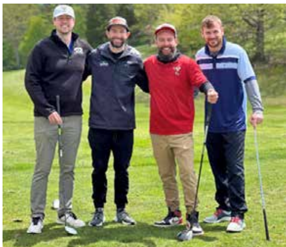
Chessie Federal Credit Union