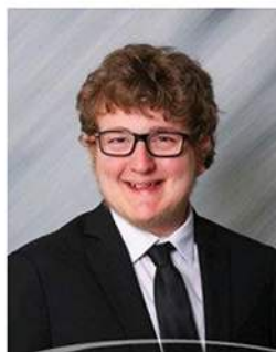
John McGuire CENTER FOR CAREER AND TECHNICAL EDUCATION