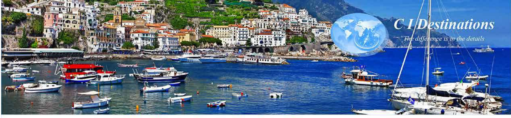
The Allegany County Chamber of Commerce presents Pompeii and the Amalfi Coast