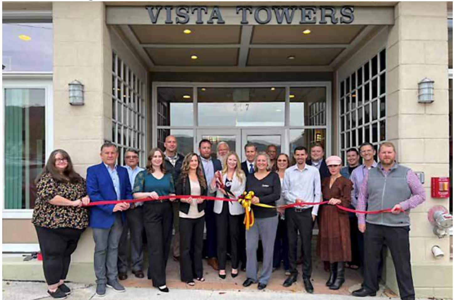
Wells Fargo Advisors