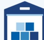
Warehouse and Industrial