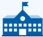
Schools and Higher Education