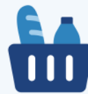
Grocery and Convenience